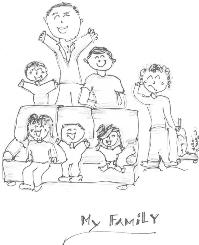
Figure 1: Family and Socialization