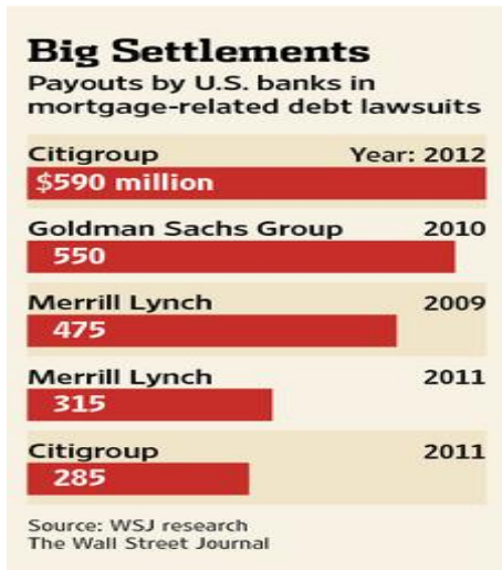
FIGURE 2: RECENT US BANKING SETTLEMENTS