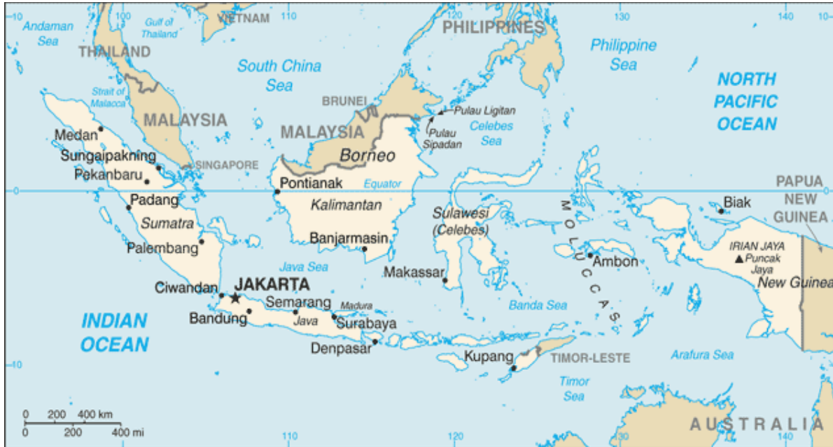
FIGURE 1: POLITICAL MAP OF INDONESIA