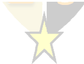
Figure derived from information posted on IRS web page entitled: “Affordable Care Act of 2010- News Releases, Multimedia and Legal Guidance” as of August 22, 2014. Retrieved August 23, 2014, from http://www.irs.gov/uac/Affordable-Care-Act-of-2010-News-Releases-Multimedia-and-Legal-Guidance